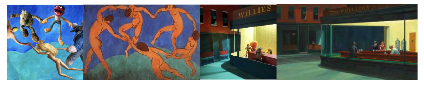
<u>TASK 3:</u> (My Favourite task) Recreate your favourite art work with yourself, friends, family or things around the house.